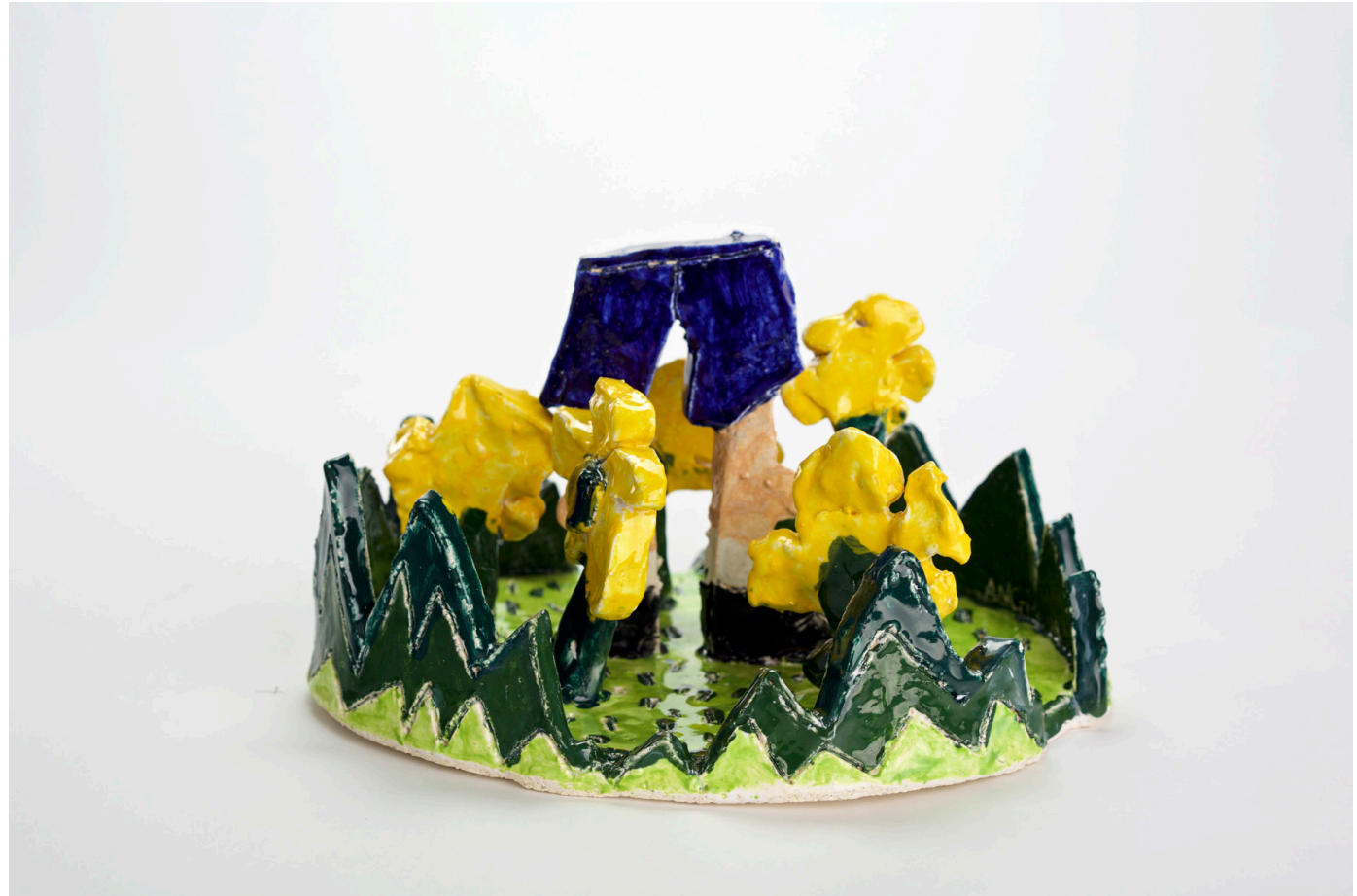
Dancing in the Tulips 2018 Earthenware & Glaze 15x19x22 cm SOLD